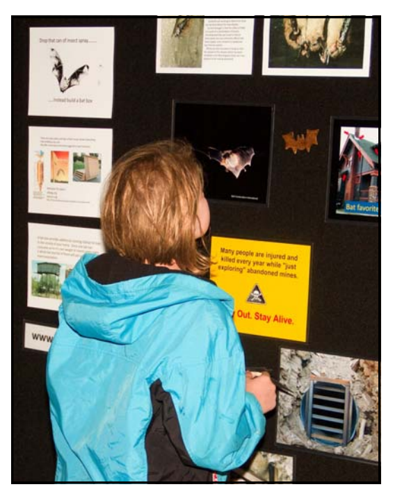
Display boards helped cover bat-related topics.

Biologists and other bat enthusiasts spent the evening discussing bats and bat-related topics. Some of the bats roosting in the Tatanka Theatre made their second annual appearance by flying around inside the theatre allowing those attending to hear real-time echolocation on ultrasonic bat detectors.