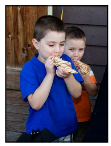
Bats are delicious!