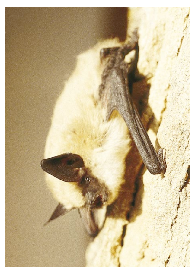
FIG. 1. Myotis ciliolabrum from southeastern Alberta.

Specimens of M. ciliolabrum are larger in the southern United States than in the northern United States or Canada (van Zyll de Jong 1985). Average external measurements (in mm; range in parentheses; n = 34) from New Mexico were: total length, 89.1 (80–99); length of tail, 41.5 (37–49); length of hind foot, 7.7 (6–9); length of ear, 14.7 (12–16); and length of forearm, 33.5 (31.28–35.77—Bogan 1974). Average skull (Fig. 2) dimensions (in mm; range in parentheses; n = 20) from Arizona were: greatest length of skull, 14.4 (13.5–14.7); mastoid width, 7.32 (6.97–7.57); least interorbital breadth, 3.20 (3.04–3.45); cranial depth, 4.70 (4.35–4.91); length of maxillary toothrow, 5.60 (5.43–5.81); and maxillary width at M3, 5.56 (5.25–5.81—Hoffmeister 1986). Measurements (in mm) of 4 male and 10 female M. ciliolabrum , respectively, from